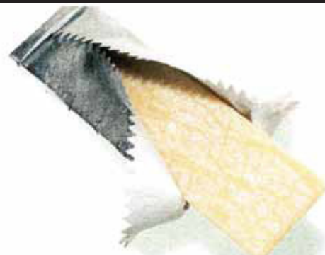
Yes, this is a beauty tool.

Q Do I really have to stop using self-tanner in the fall?